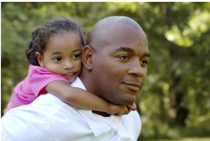
a hand can give you hope . . .