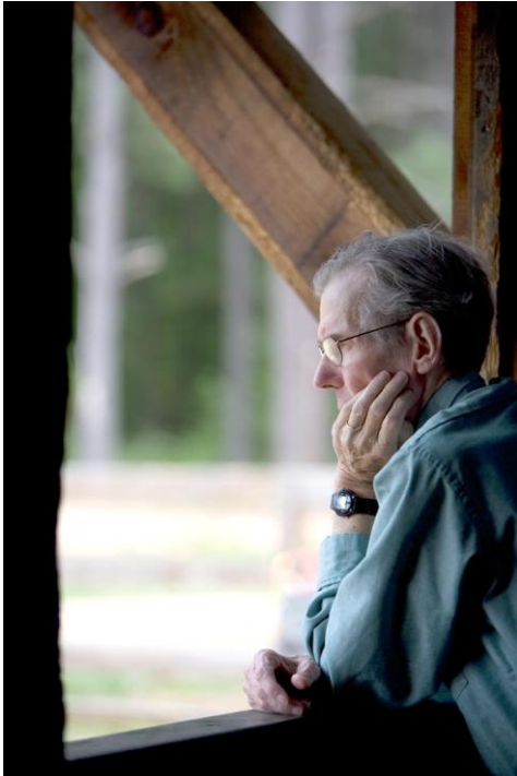
loneliness can break your heart . . .

Those who support Samaritan's mission know . . .