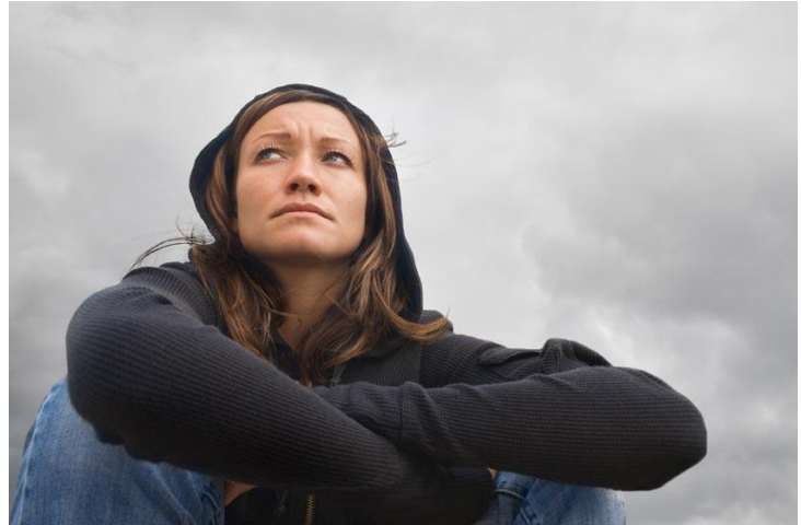
fear can hold you hostage . . .